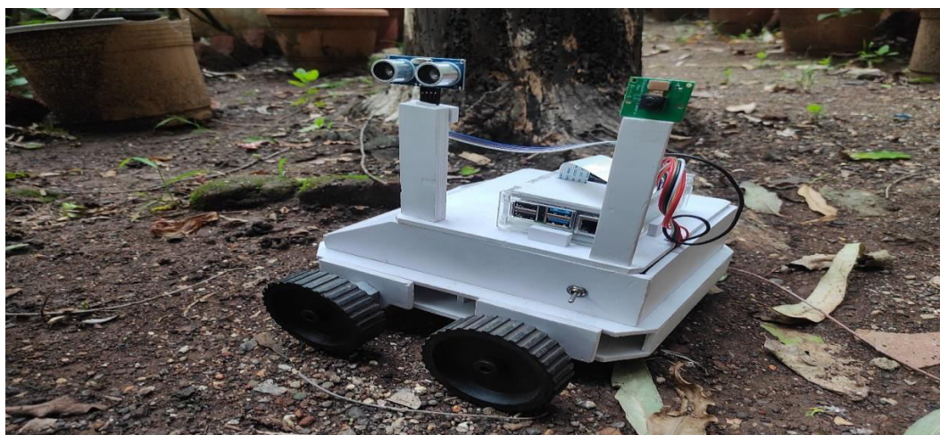
Fig. 3: Autonomous Plant Diseases Detection Robot Prototype

The system demonstrated reliable real-time processing of leaf images with an average classification accuracy of 94.5% . The onboard CNN model executed on the Raspberry Pi efficiently processed images within an average time of 1.3 seconds per image. The robot was able to navigate autonomously across a 1m × 1m test field with multiple artificial obstacles. Obstacle avoidance using the HC-SR04 Ultrasonic Sensor achieved an accuracy of 96% , allowing smooth traversal during field operation. Captured disease classification results and corresponding leaf images were successfully uploaded to a cloud database. The cloud dashboard provided clear visualization of disease history and detection results.